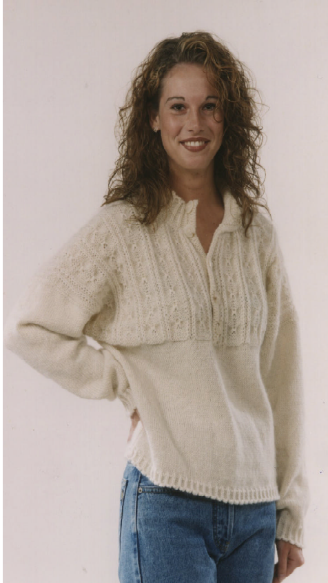
Garment pattern from Knitwords magazine