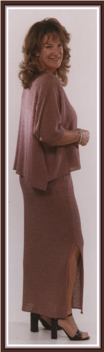
Garment pattern from Knitwords magazine

Knitting That's Simply Beautiful and Beautifully Simple